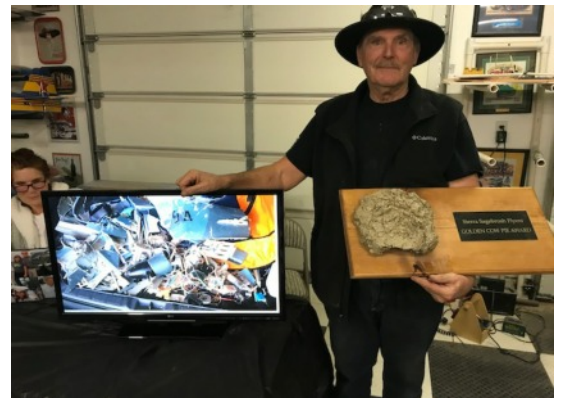
See the meeting minutes for details....